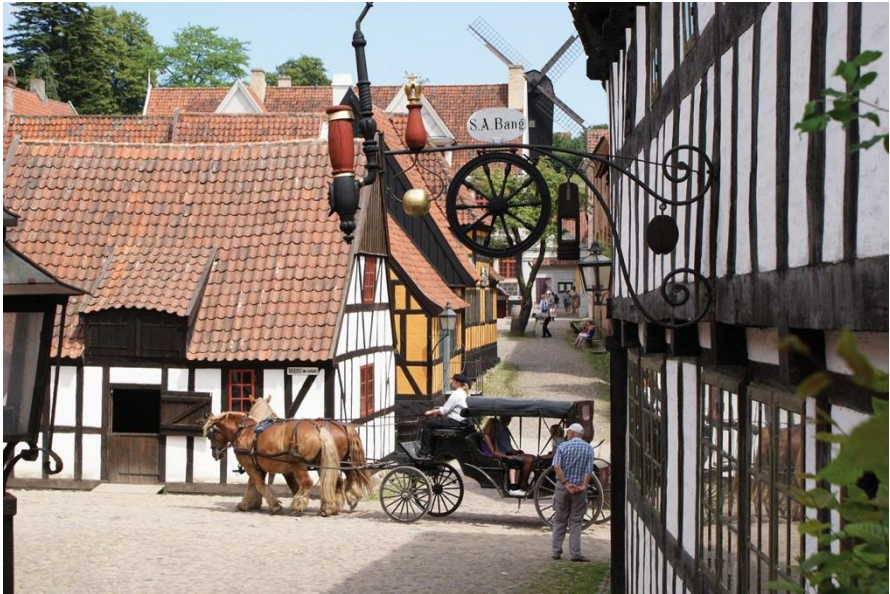
Den Gamle By "The Old Town" Open-Air museum