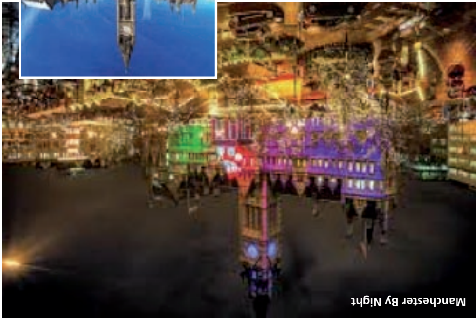
Manchester By Night

Playing on 19th June 2016 at Etihad Stadium & SPECIAL GUESTS